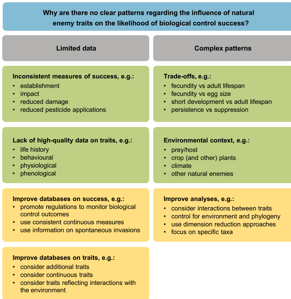
Trends in Ecology & Evolution

Regulations related to biological control are likely to limit the accumulation of data and to introduce biases in the available databases. In particular, a more risk-averse approach to releases began in the 1990s following the recognition of nontarget effects attributable to previous releases of generalist agents [3]. This resulted in declining rates of new introductions worldwide [7,16] and to preferences for introducing agents that had already successfully controlled target pests elsewhere [17]. To reduce occurrence of nontarget effects, the current importation of